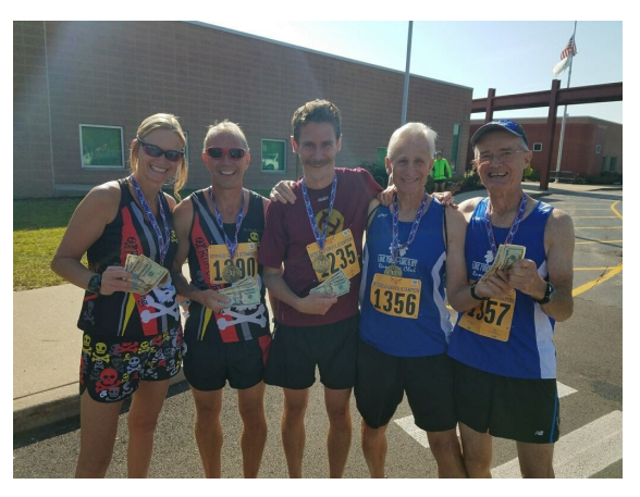
WHAT'S BETTER THAN A POST RACE BREAKFAST?