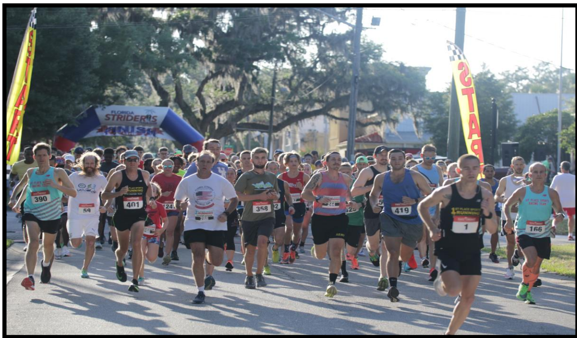
Runners at the start of the 38 th Annual Florida Striders Memorial Day 5k on May 31, 2021.