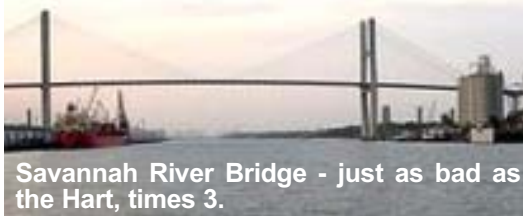
Savannah River Bridge - just as bad as the Hart, times 3.