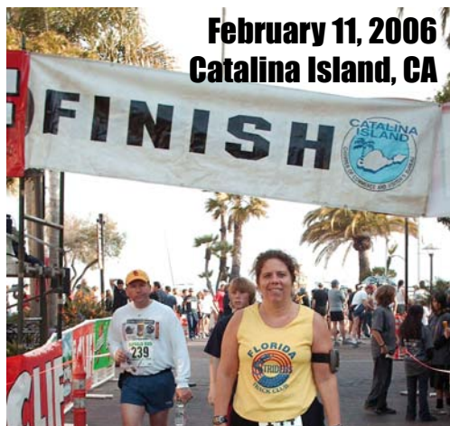
The Buffalo Run Half-Marathon

The Road Runners Club of America is a non-profit organization of over 700 running clubs and 175,000 members across the United States. The RRCA chapters organize races, have training runs, provide safety guidelines, promote children's and masters fitness running programs, and have social programs. http://www.RRCA.org