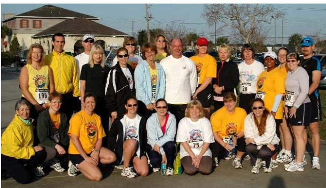
The Florida Striders New Runner class at Matanzas 5000 on January 28th